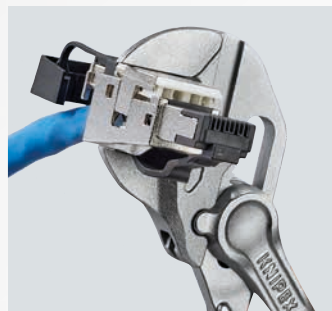
Large capacity, precise grip: As the jaws always grip in parallel, the Pliers Wrench XS is particularly gentle on hex heads with decorative finishes in sizes up to 21 mm width across flats.